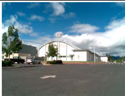
NE General Site