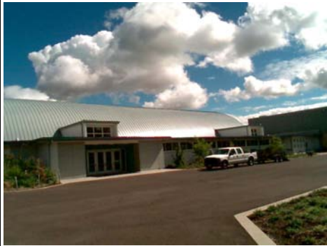
SW Vertical Irregularity Primary