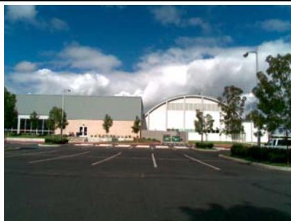
E General Site new bldg on left bldg A on right