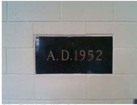
SW Field Verified Year Built 1952