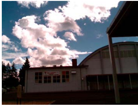
W Falling Hazard chimney