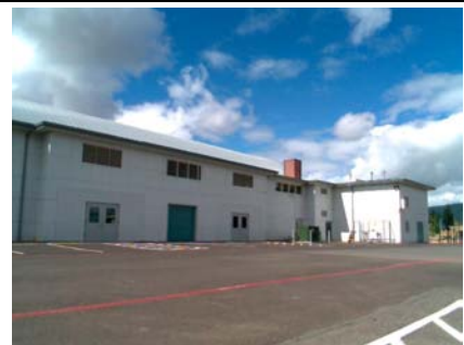
N General Site