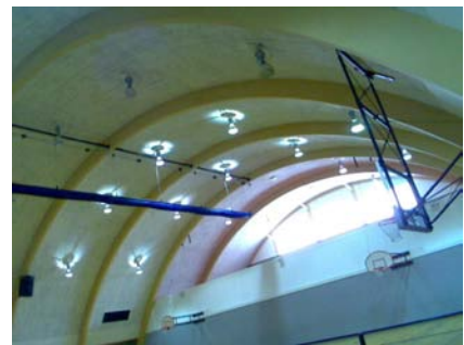
W General Site