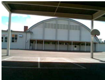
W General Site