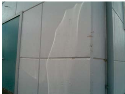
NW Primary Structural Type