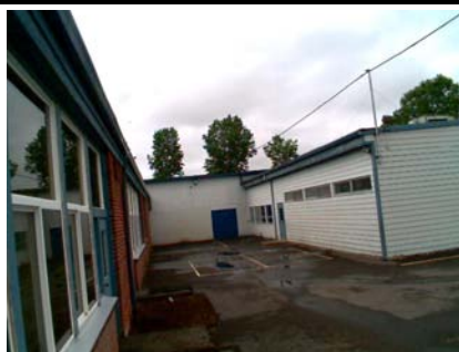
N General Site