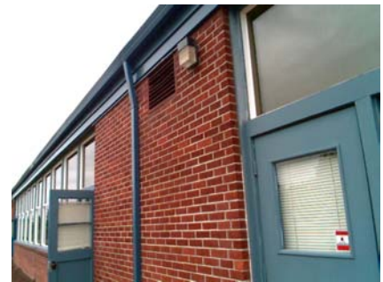
NE Falling Hazard