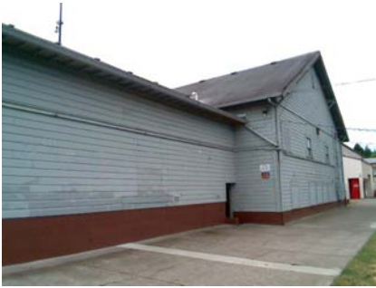
NE General Site