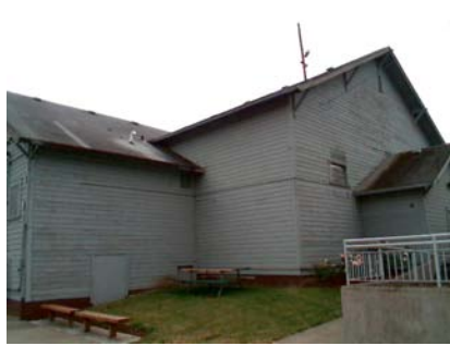
NW General Site