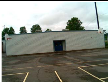
N General Site