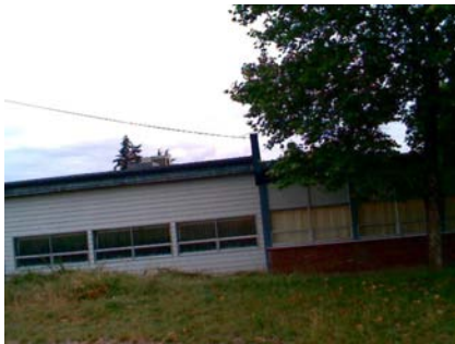
SW General Site