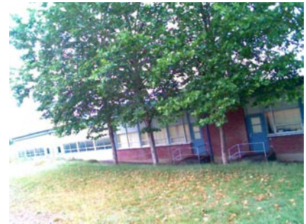
SW General Site