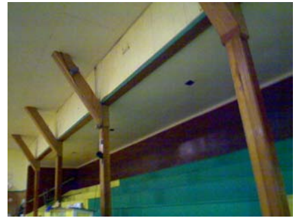
SW Primary Structural Type