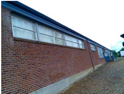
SE General Site