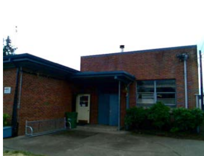
NW General Site