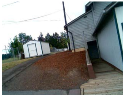
E Vertical Irregularity Secondary