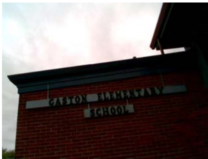
N Building Name