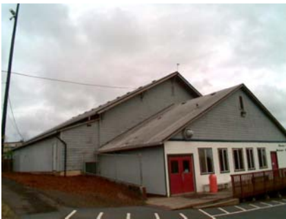
SE Vertical Irregularity Primary