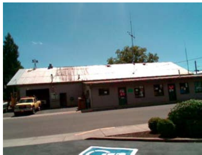
N Elevation View