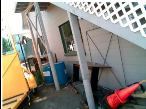
N Falling Hazard