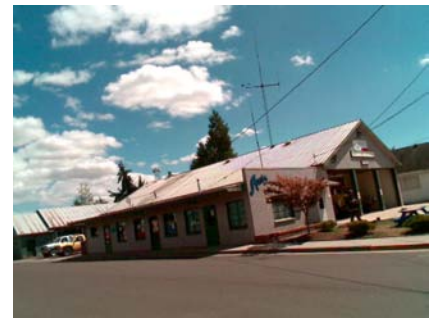
NW Elevation View