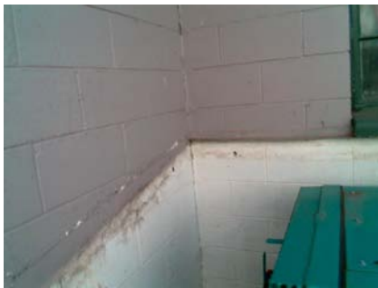
NE Primary Structural Type