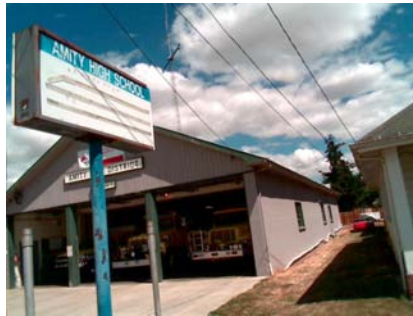
SW Elevation View