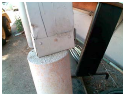
NE Falling Hazard