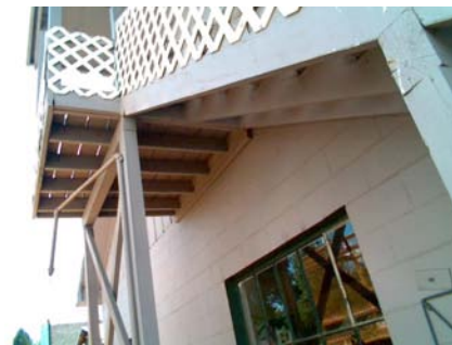
N Falling Hazard