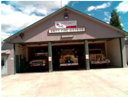
W Plan Irregularity Primary