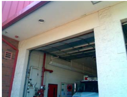
NW Secondary Structural Type concrete over doors