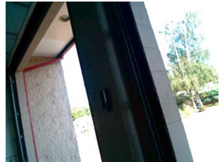
SE Building Quality