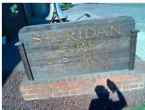
NE Building Name