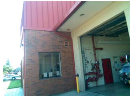
NW Plan Irregularity Primary