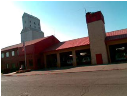
NW Vertical Irregularity Primary