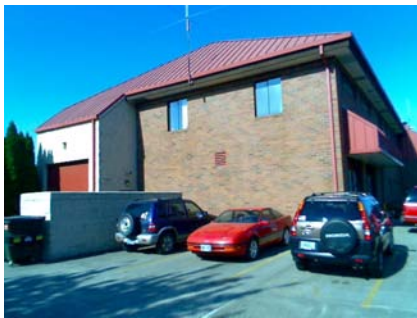
N Plan Irregularity Primary