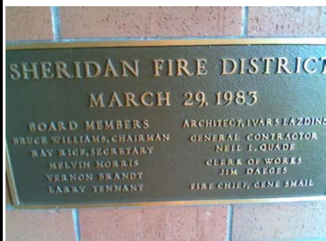
E Field Verified Year Built 1983