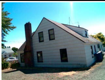
W Elevation View