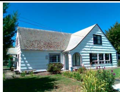
E Elevation View