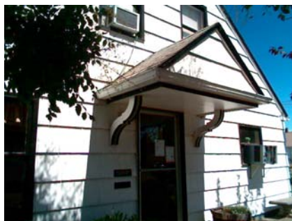
S Falling Hazard