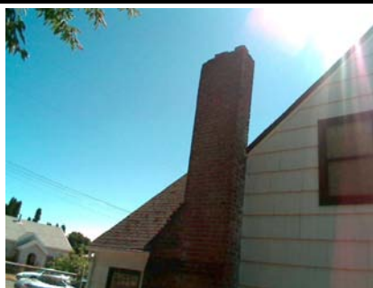
W Falling Hazard