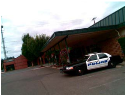
SE Falling Hazard