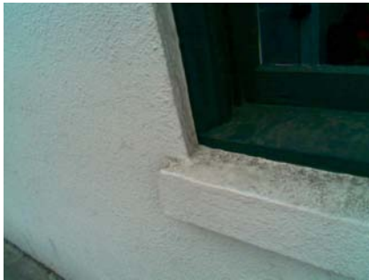
NW Building Quality