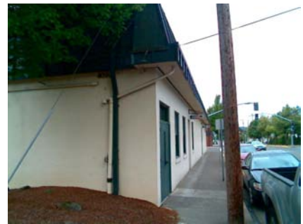
NE Elevation View