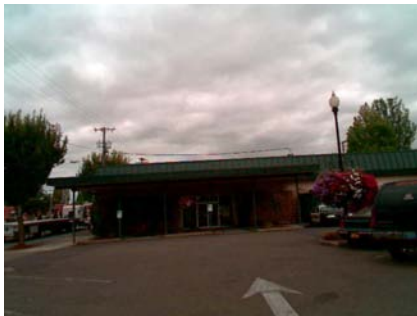
S Elevation View