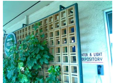
SE Falling Hazard