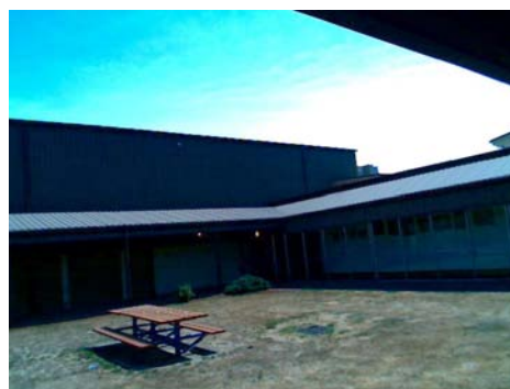
W Vertical Irregularity Primary