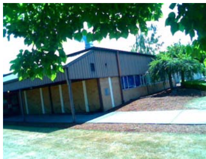
NW Elevation View