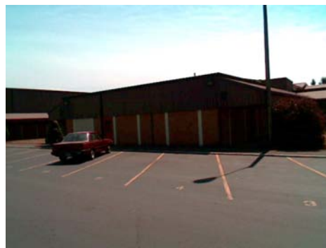
NW Elevation View