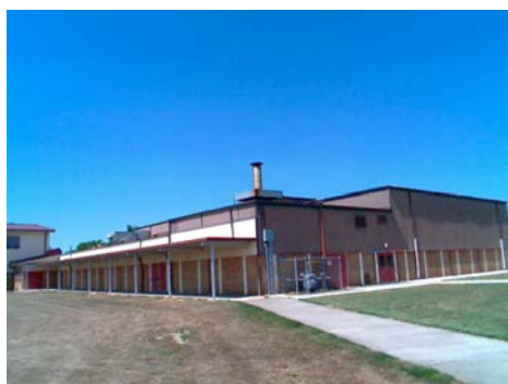
SE Elevation View