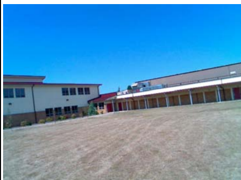
SE Vertical Irregularity Primary