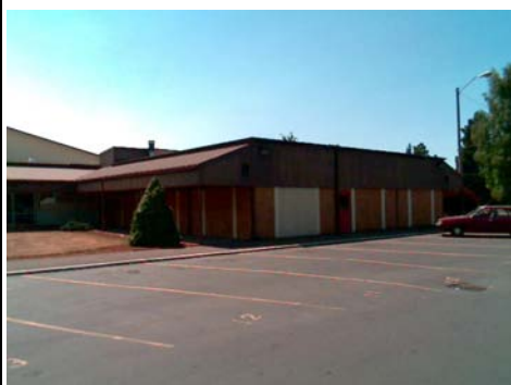
NE Elevation View