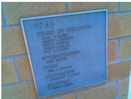
W Field Verified Year Built 1965