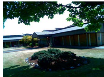
NW Elevation View