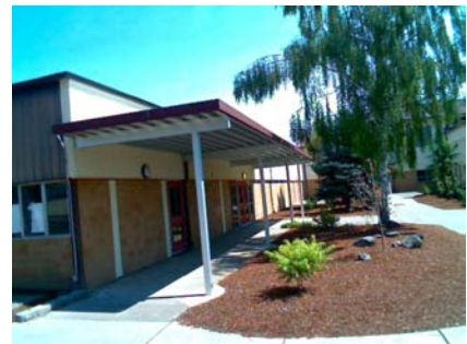
W Falling Hazard