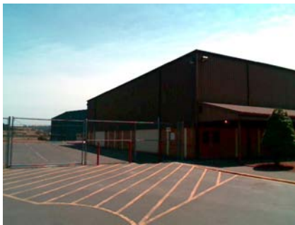
NW Elevation View