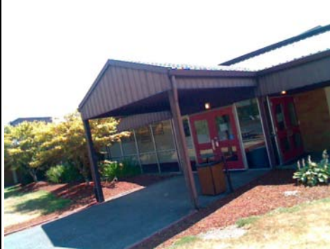
W Falling Hazard