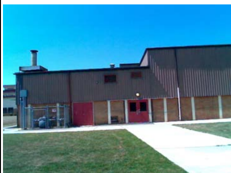
E Vertical Irregularity Primary