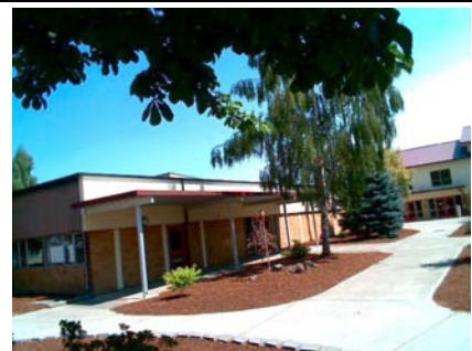
SW General Site