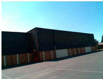
NE Elevation View