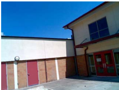
SW Elevation View new bldg on right