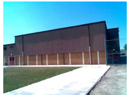
E Elevation View