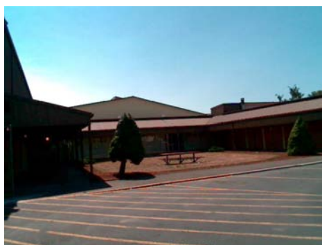
NE Elevation View