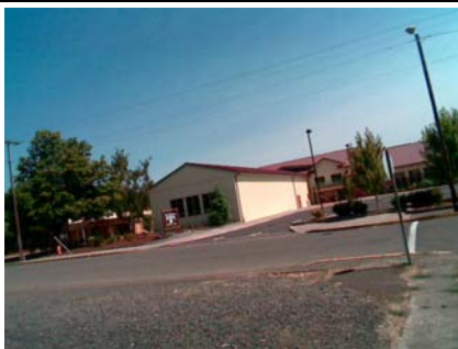
SW General Site