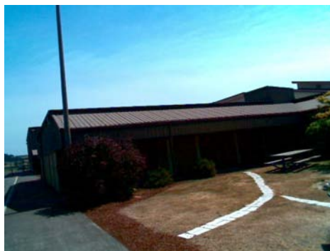
W Elevation View