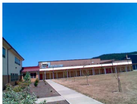
S Elevation View