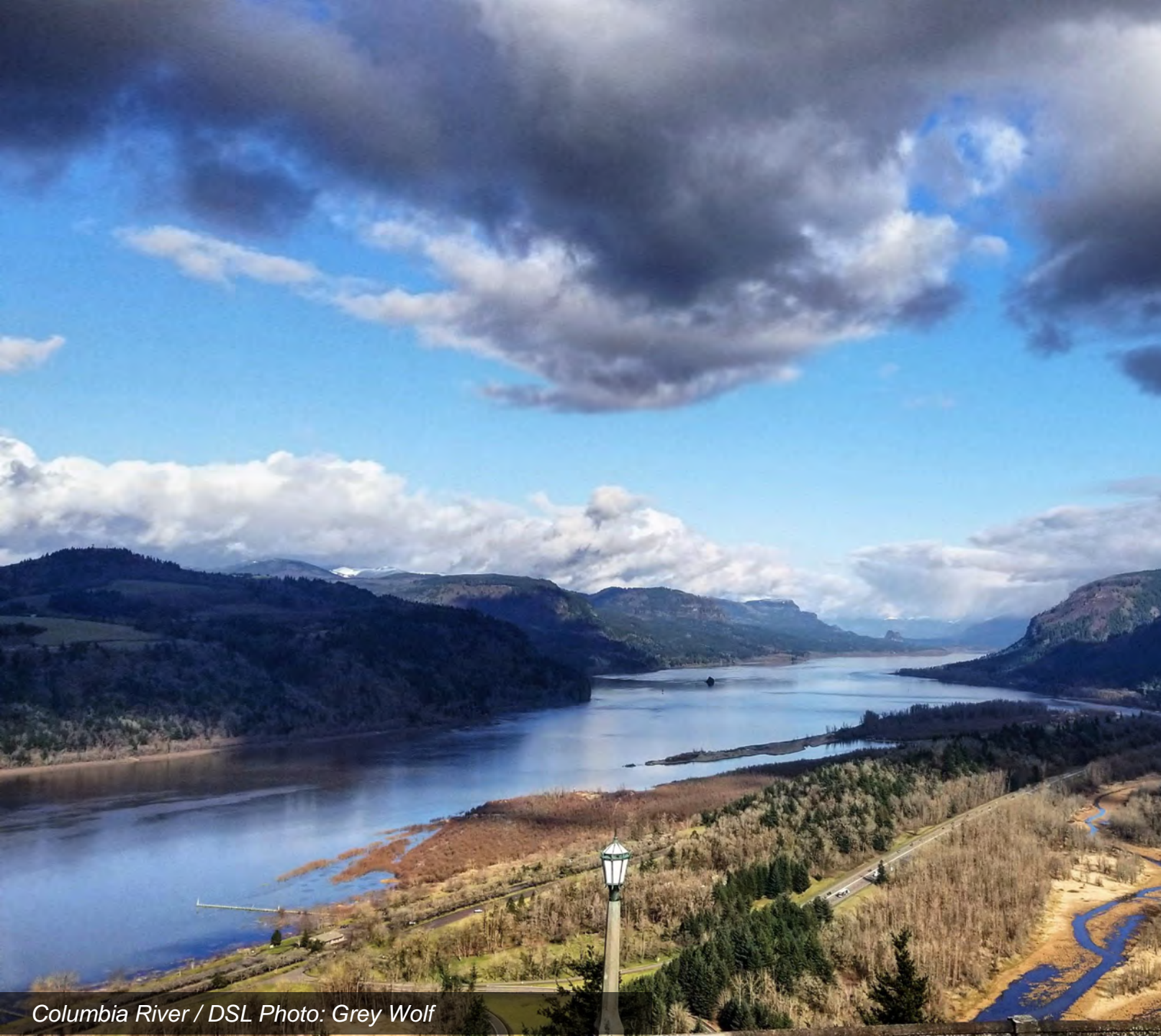
Columbia River / DSL Photo: Grey Wolf