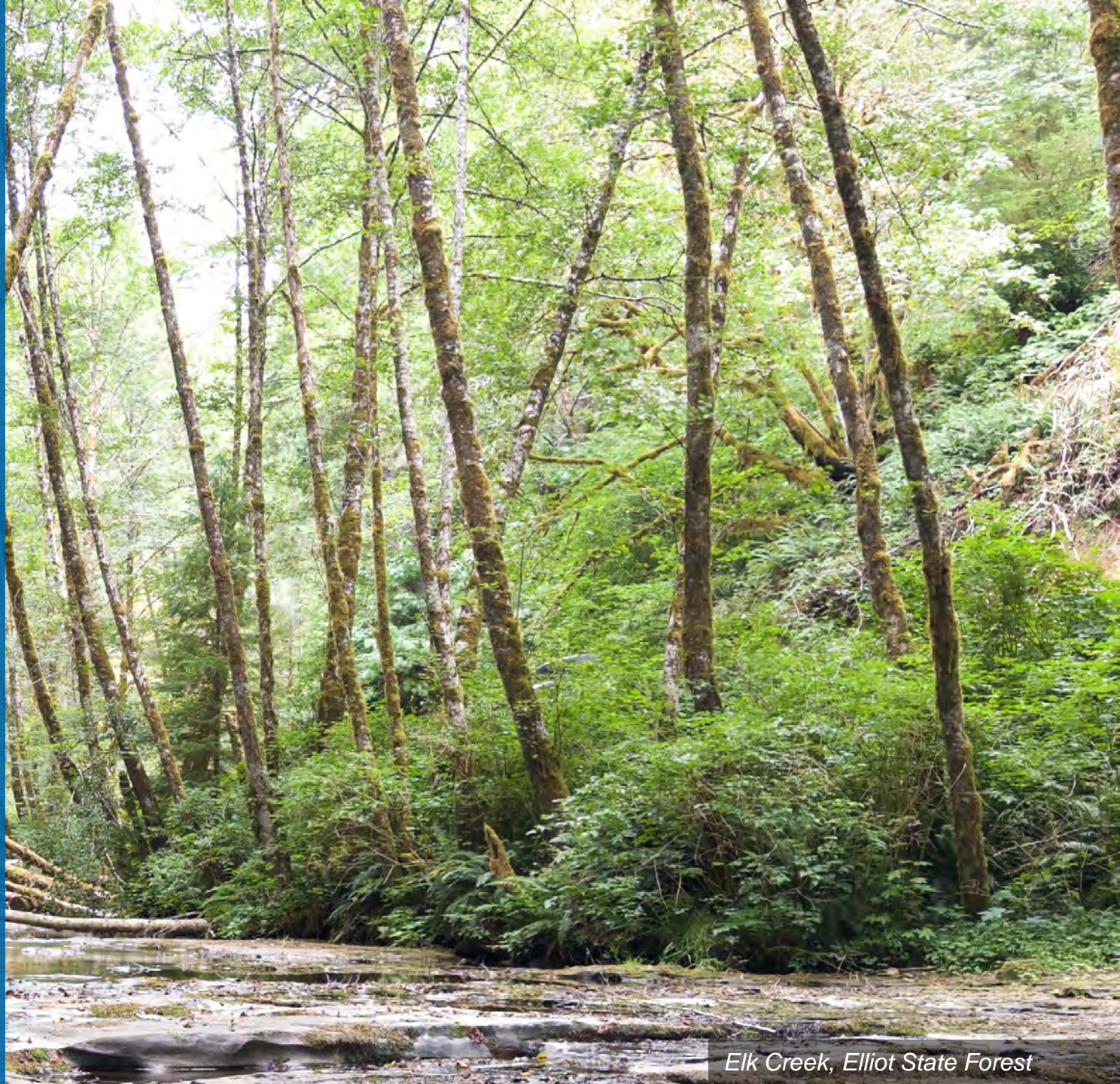
Elk Creek, Elliot State Forest