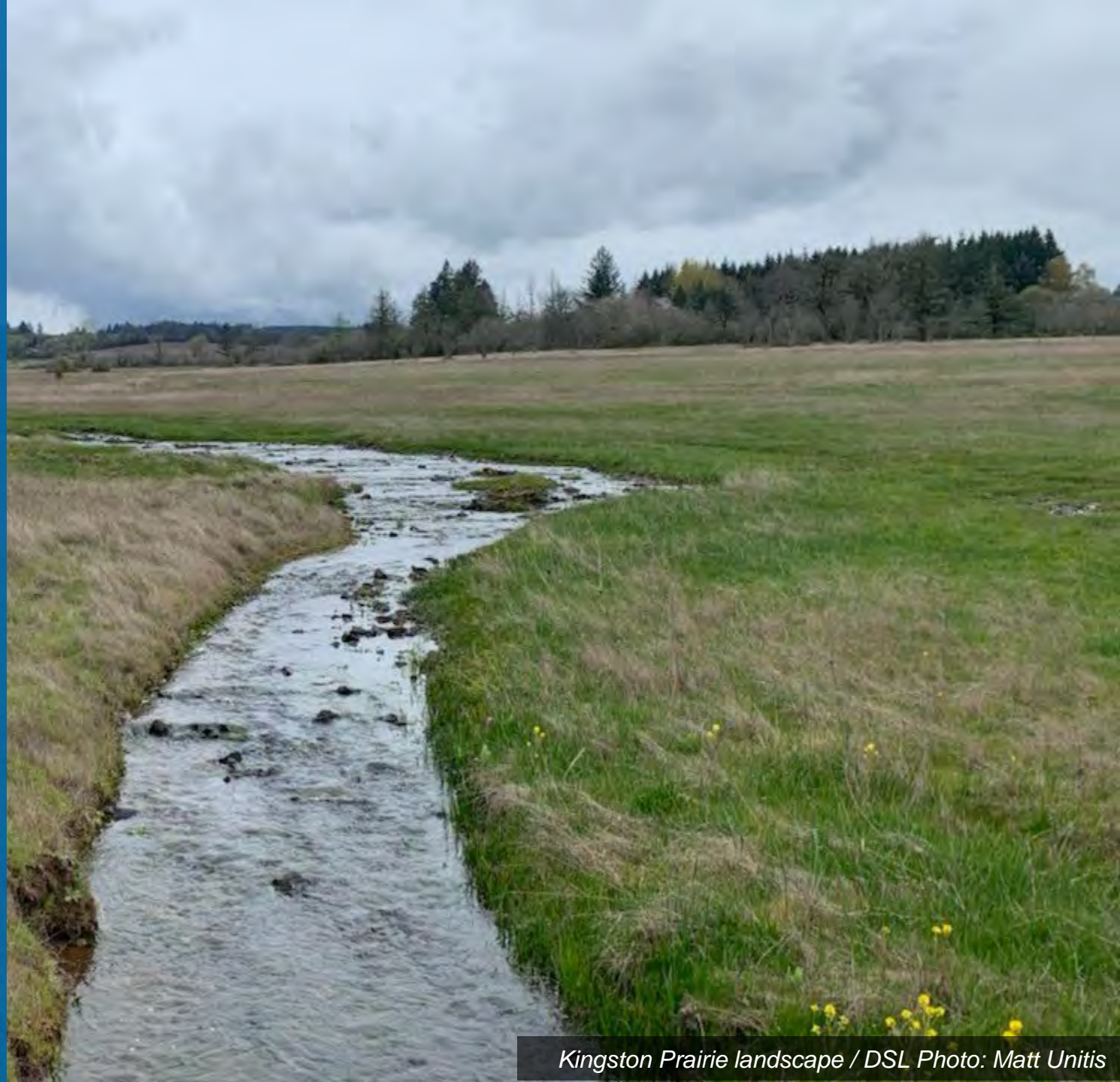
Kingston Prairie landscape