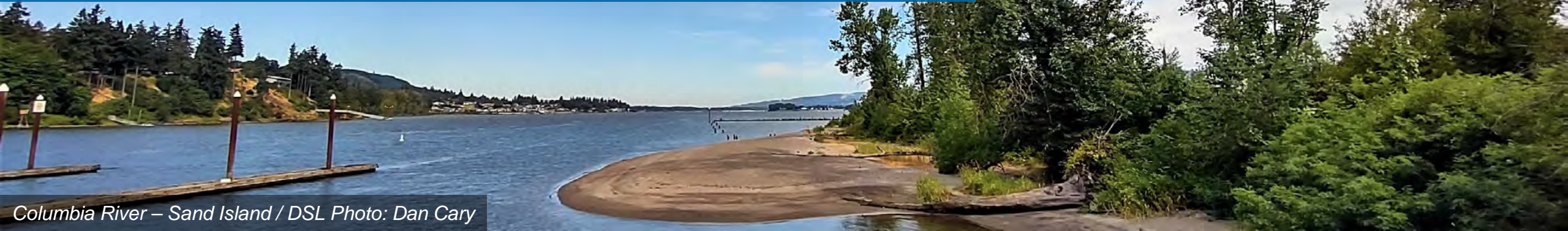
Columbia River – Sand Island / DSL