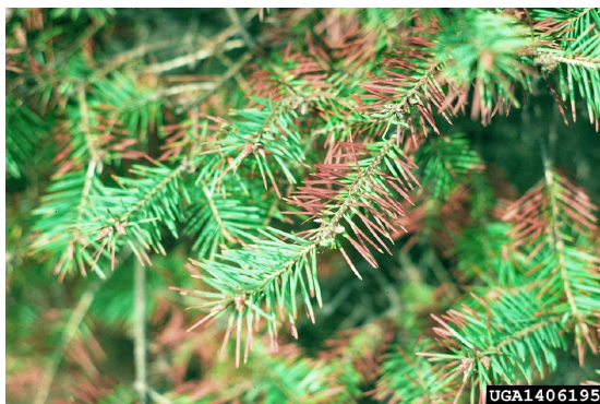
Figure 2: Douglas fir infected with Phaeocryptopus gaeumannii USDA Forest Service – North Central Research Station Source: www.forestryimages.org

Across the planet, forest communities have changed in response to changes in pathogen ranges facilitated by climate change. On the eastern seaboard, the hemlock woolly adelgid ( Adelges tsugae ) is currently decimating hemlock forests (Thompson et al. 2013). This parasite has moved steadily northward from its initial observation point in Richmond, VA in 1952, and is currently changing the species mix of forests as far north as Massachusetts. The parasite's spread seems limited by cold temperatures at higher latitudes, but as warming continues, the quiet epidemic seems likely to spread.