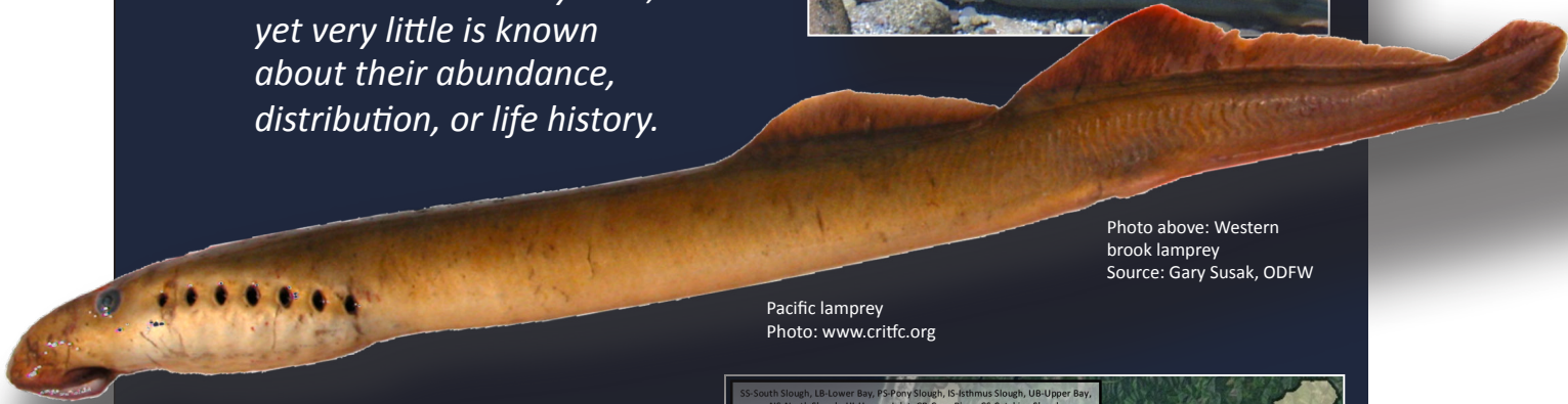
Pacific lamprey