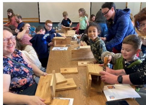
CBPL Birdhouse Workshop

The Reserve education team provides a variety of community programs, including numerous interpretive learning opportunities about a wide range of local topics, information and activity tables at events, programs presented with partner organizations, STEM activities for children and stewardship activities with a learning component. Community education is offered to all ages both on site and in a variety of places around the region.