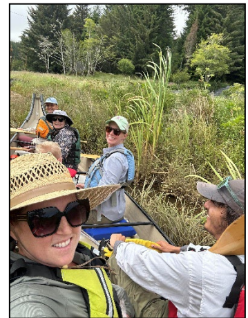
Estuary Ambassadors canoeing in Winchester Cr