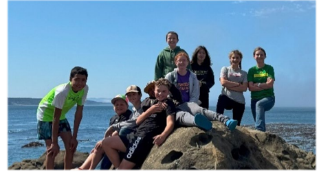
Marshfield Junior HS Science Camp