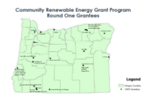
Click image to enlarge

The Community Renewable Energy Grant Program is open to Oregon Tribes, public bodies, and consumer-owned utilities. Public bodies include counties, municipalities, and special government bodies such as ports and irrigation districts. Grants are awarded on a competitive basis and priority will be given to projects that support program equity goals, demonstrate community energy resilience, and include energy efficiency and demand response.