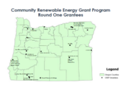
Click image to enlarge

The Community Renewable Energy Grant Program is open to Oregon Tribes, public bodies, and consumer-owned utilities. Public bodies include counties, municipalities, and special government bodies such as ports and irrigation districts. Grants are awarded on a competitive basis and priority will be given to projects that support program equity goals, demonstrate community energy resilience, and include energy efficiency and demand response.