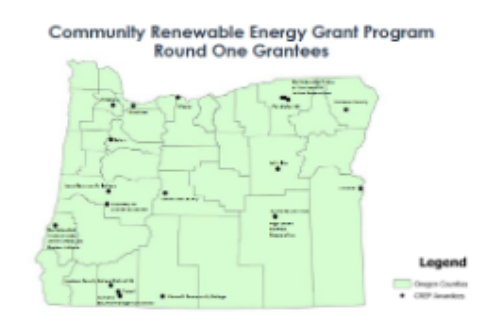
Click image to enlarge

The Community Renewable Energy Grant Program is open to Oregon Tribes, public bodies, and consumer-owned utilities. Public bodies include counties, municipalities, and special government bodies such as ports and irrigation districts. Grants are awarded on a competitive basis and priority will be given to projects that support program equity goals, demonstrate community energy resilience, and include energy efficiency and demand response.