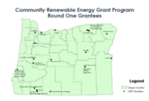
Click image to enlarge

The Community Renewable Energy Grant Program is open to Oregon Tribes, public bodies, and consumer-owned utilities. Public bodies include counties, municipalities, and special government bodies such as ports and irrigation districts. Grants are awarded on a competitive basis and priority will be given to projects that support program equity goals, demonstrate community energy resilience, and include energy efficiency and demand response.