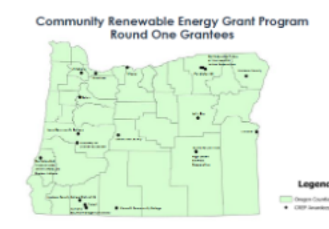
Click image to enlarge

The Community Renewable Energy Grant Program is open to Oregon Tribes, public bodies, and consumer-owned utilities. Public bodies include counties, municipalities, and special government bodies such as ports and irrigation districts. Grants are awarded on a competitive basis and priority will be given to projects that support program equity goals, demonstrate community energy resilience, and include energy efficiency and demand response.