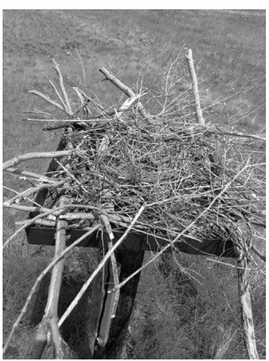
Photo 2. ANS #4 with fresh nest material (smaller sticks and yellow starthistle) added by red-tailed hawks in April 2020.

(low resolution image taken from a distance)