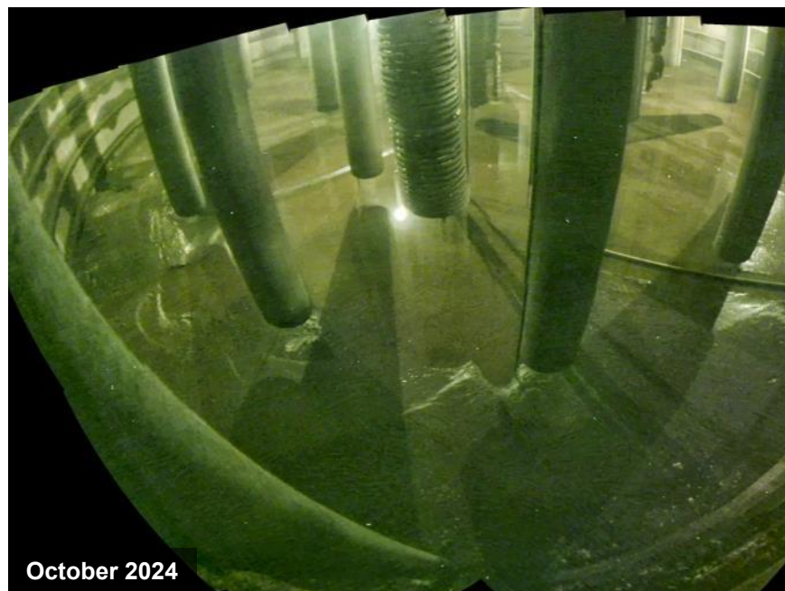
Inside Tank AX-101 before waste retrieval