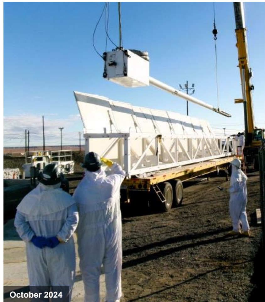
Tank A-102 pit equipment