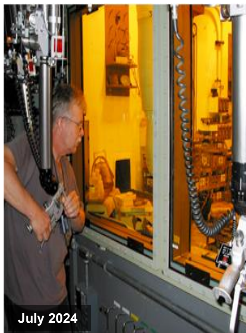
Operator using equipment in a hot cell