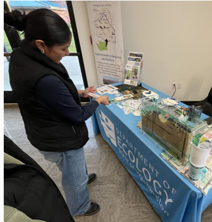
(L) Toppenish students using a makeshift pump-and-treat facility to clean groundwater. (R) Ecology staff attending the Tri-Cities Sportsmens Show.