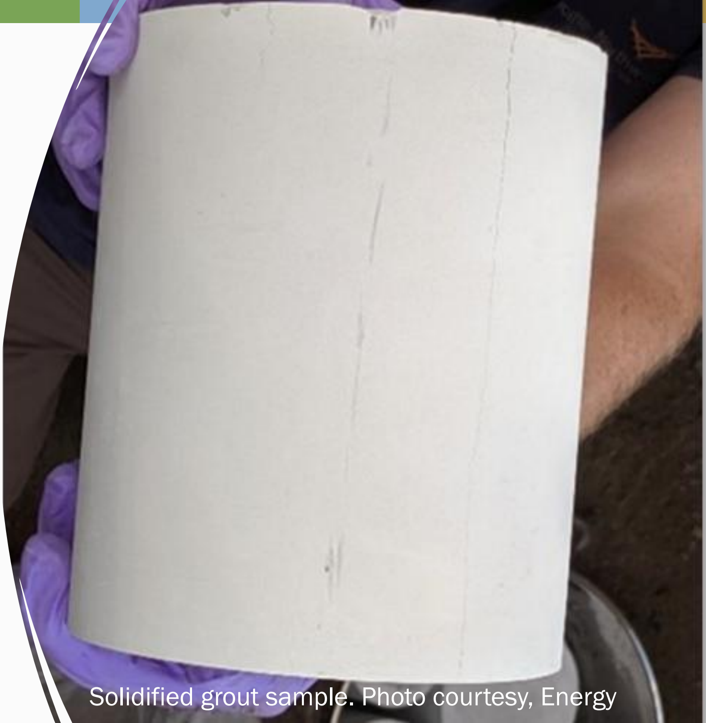
Solidified grout sample.