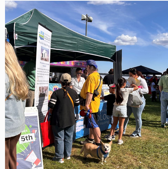
Ecology staff participated in several events around central Washington including the Wenatchee River Salmon Festival (left) and the RiverFest '25 (right).