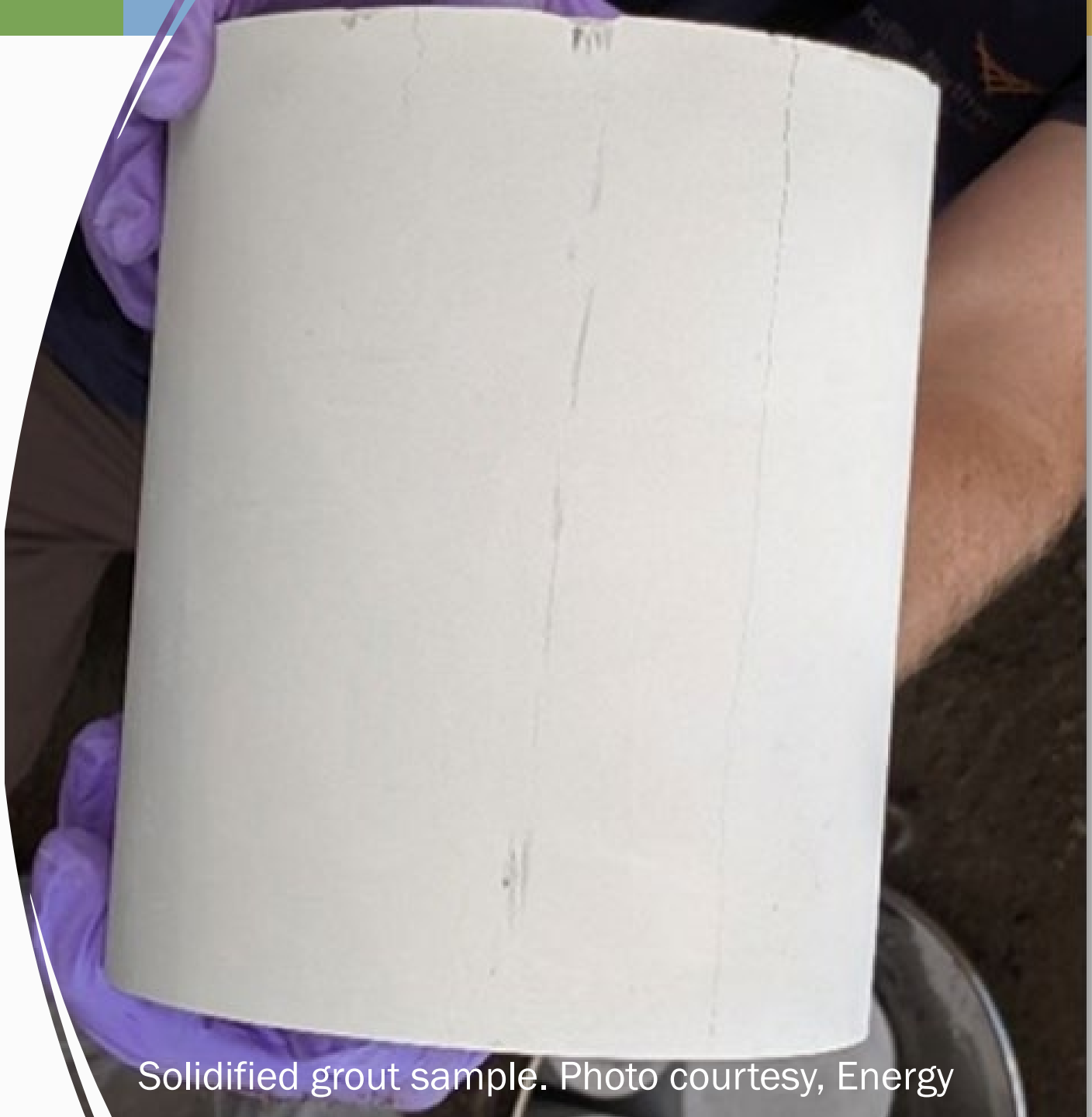
Solidified grout sample.