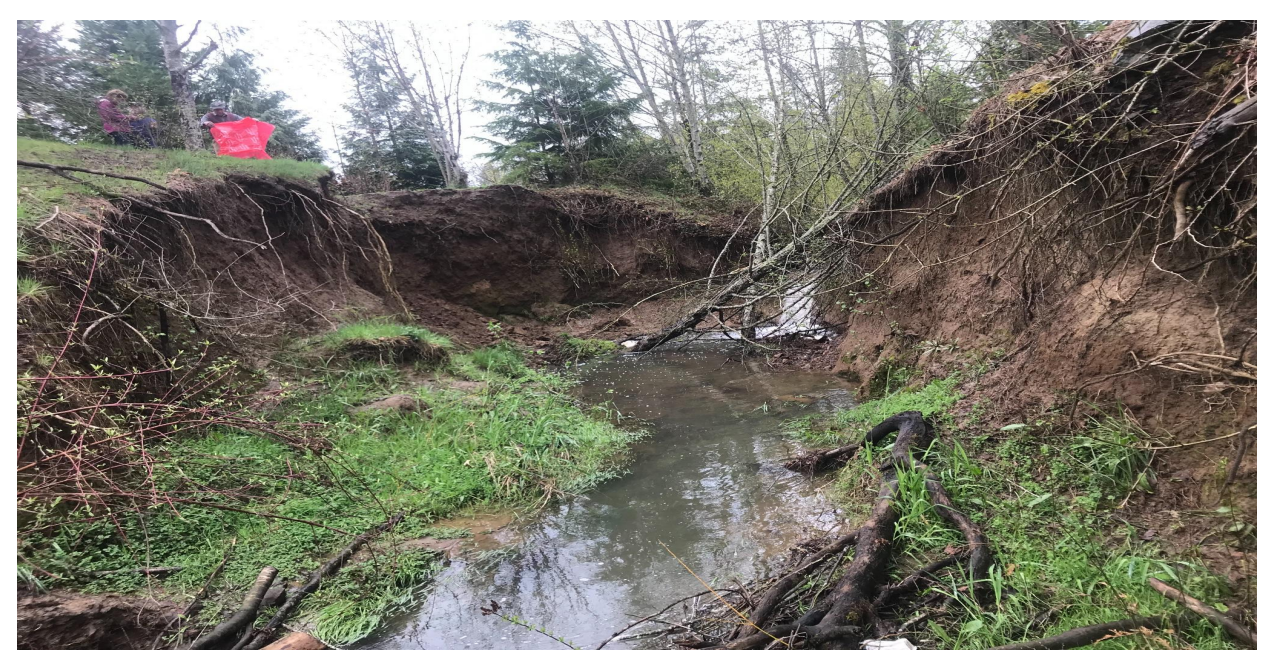
Exhibit A: Unnamed tributary in King City Community Park. Erosion is the result of unmitigated stormwater runoff from the uphill Bull Mountain community. The headcutting of this stream is occurring at a rate of approximately 8 feet per year.

Lastly, wetlands provide positive health benefits to community members. Wetlands hold recreational, cultural, and aesthetic value, and these values play a direct role in a person's physical and mental health and well-being.<sup>4</sup> Communities need natural areas; this is more evident than ever since the pandemic. As a result, wetlands should be preserved, protected, and restored, not placed in further endangerment.