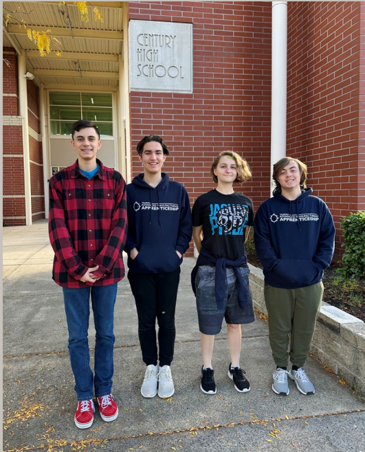
Second Cohort – Graduating June 2026