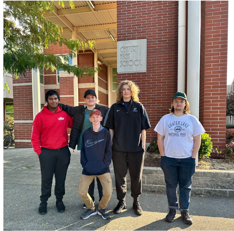
Inaugural Cohort – Graduated June 2024

Education + Hands-On Learning + Career Readiness