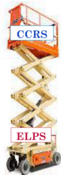
Figure 1 4

Oregon Adult English Language Proficiency Standards (OAELPS) are closely connected to the Oregon Adult College and Career Readiness Standards (OACCRS). OAELPS are intended to support English language ABS learners in meeting the OACCRS, whether they are in English language learning classes or in other types of ABS classes such as GED and Adult Education (see Figure 1). It is expected that as learners advance in their English language skills, there will be increasing use of OACCRS with decreasing OAELPS support, as illustrated in Figure 2 below.