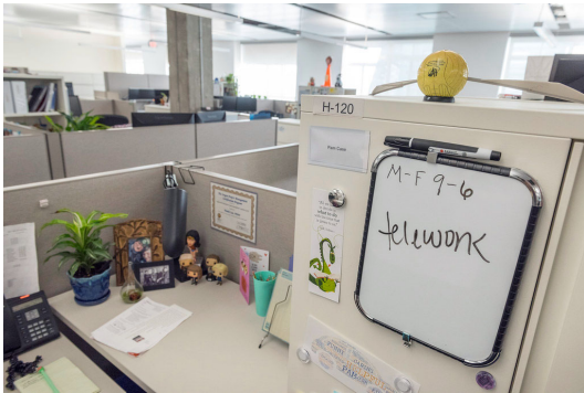
From Oregon Department of Transportation flickr photos .