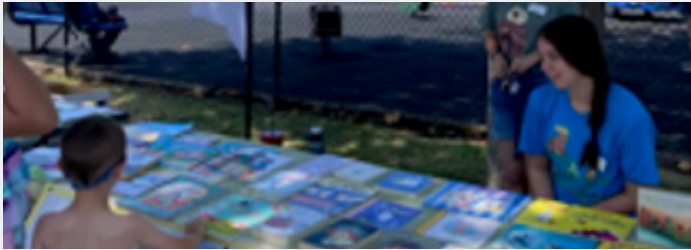
TEEN INTERN WORKING AT OUTREACH EVENT FOR THE C. GILES HUNT MEMORIAL LIBRARY

Libraries in North Bend, Oakland, Reedsport , and Sutherlin hired teen interns who developed valuable work skills while contributing to library projects, such as creating new teen programs and engaging in outreach.