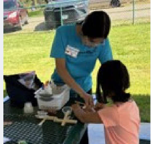
THE TEEN INTERN AT MCMINNVILLE PUBLIC LIBRARY ORGANIZED CHILDREN'S ACTIVITIES DURING COMMUNITY EVENTS.

"There was always something to do or learn from, which I personally like having and how I like to work." - Teen intern at Willamina Public Library