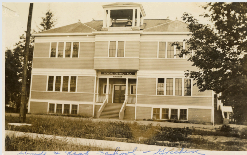
A BLACK-AND-WHITE PHOTOGRAPH OF A FARM IN DALLAS, 1890S, ONE OF OVER 900,000 ITEMS AVAILABLE ON NORTHWEST DIGITAL HERITAGE.

The State Library , in partnership with the Washington State Library and the Oregon Heritage Commission , launched Northwest Digital Heritage, a platform that allows libraries, museums, and cultural organizations to share their local history collections online.