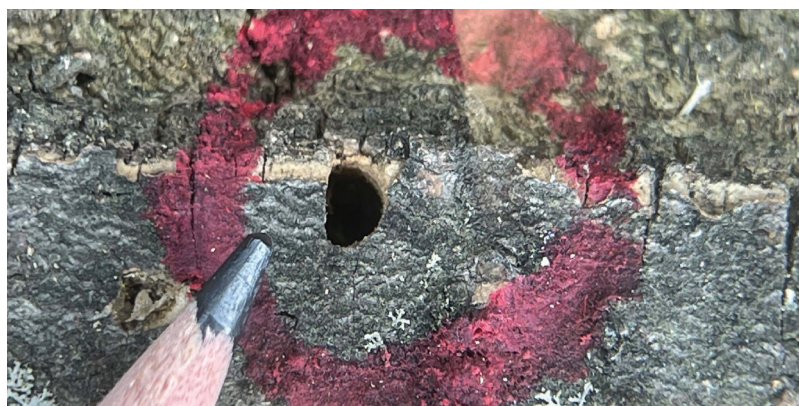
D-shaped emergence hole