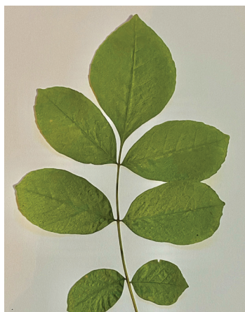
Oregon Ash leaf