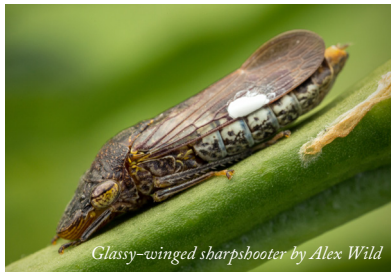
Glassy-winged sharpshooter by Alex Wild