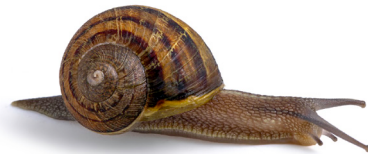
European brown garden snail by Thomas Shaban