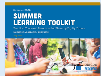
Summer Learning Toolkit