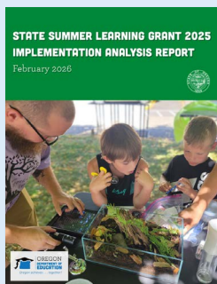
State Summer Learning Grant 2025 Implementation Analysis