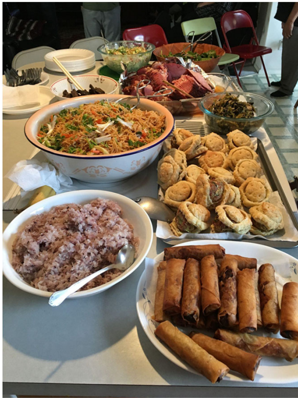
Oregon Department of Education