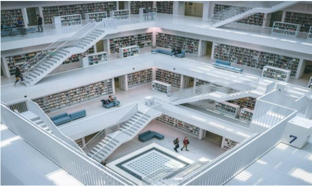
Oregon Department of Education