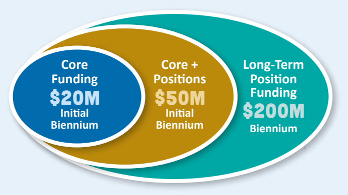
FIGURE 1. Computer Science Education Statewide Implementation Plan Funding Models

As shown in Figure 1, the estimate to hire and equip up to 128 new computer science teachers is $50 million for the initial biennium of implementation. This estimate would increase incrementally over successive bienniums to approximately $200 million to meet the state's current need for additional computer science positions.