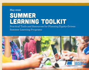
Summer Learning Best Practice Toolkit