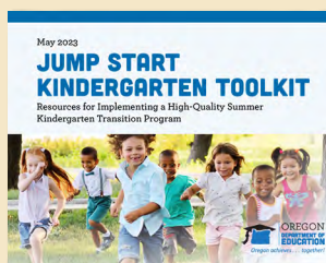
Jump Start Kindergarten Toolkit