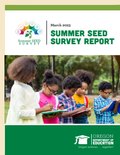
Student Voice, Summer 2022 SEED Survey