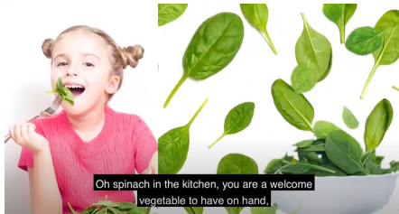
An English language version of the Spinach video .