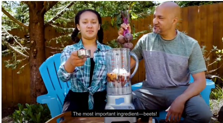
An English language version of the Beets video .

The month of October brings new additions to the Oregon Harvest for Schools (OH4S) video series!