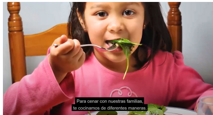
A Spanish language version of the Spinach video .

Oregon Department of Education Child Nutrition Program's and OSU Extension's Food Hero campaign have teamed up to launch this series which will include a total of 50 videos when complete. The series aims to educate students on healthy, Oregon food. For a comprehensive list of the videos we have available to date visit the Oregon Harvest for Schools website and click on the Videos tab under "Other Items."