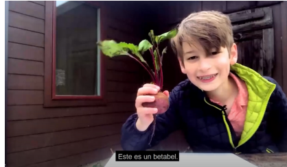
A Spanish language version of the Beets video .