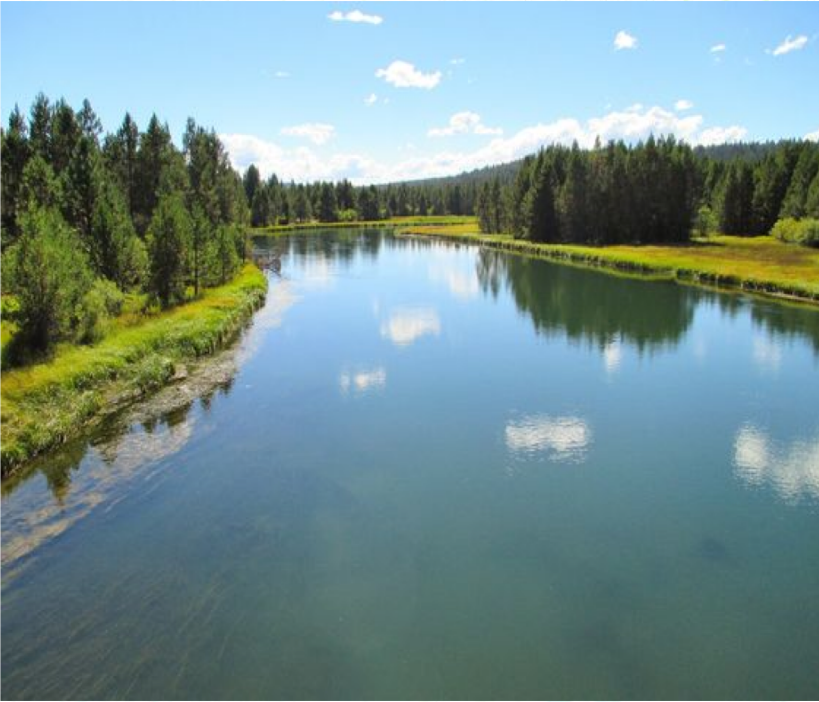
Deschutes River, Pinterest Image