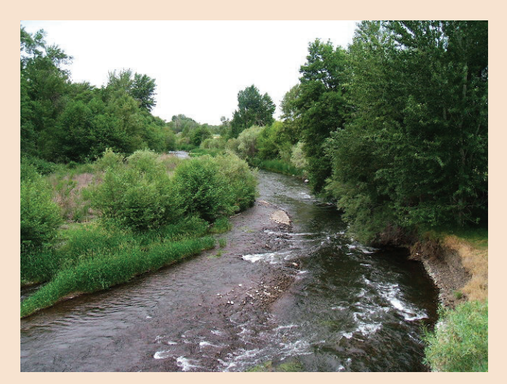
Walla Walla River near Stone Creek

The endemic chinook population in the Walla Walla had been extirpated (extinct) for some 80