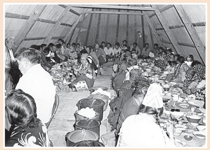
A salmon feast at a tribal longhouse. Salmon and water are the first of the First Foods. In the spring, when the tribes celebrate the salmon's return, tribal longhouses and churches must have spring chinook—no other fish will do for their First Salmon ceremonies.

To jump-start the program, the tribe released surplus Umatilla and Ringold adult spring chinook