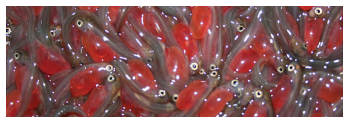
Spring chinook alevin or sac-fry hatched from eggs.

into the South Fork of the Walla Walla River. Needing additional broodstock, the Umatilla tribe was able to acquire an additional 250,000 spring chinook smolts from Carson National Fish Hatchery in Carson, Washington as a result of a U.S. v. Oregon <sup>+</sup> Interim Management Agreement. In 2005 the Umatilla tribe successfully reprogrammed these fish for release into the South Fork Walla Walla.