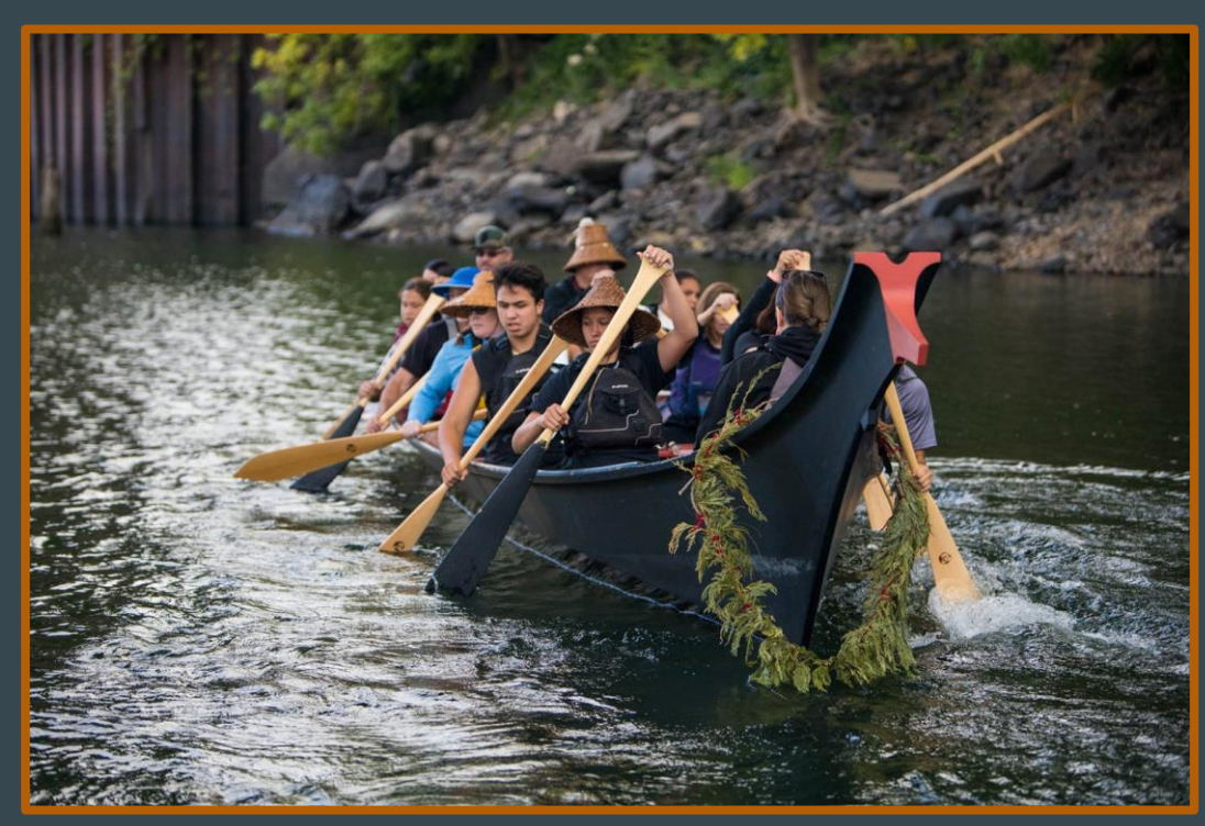
Grand Ronde Tribal members paddling Grand Ronde's canoe, Stank'iya

They wanted to make sure they, as a people, had control over their own property, people, and rights.