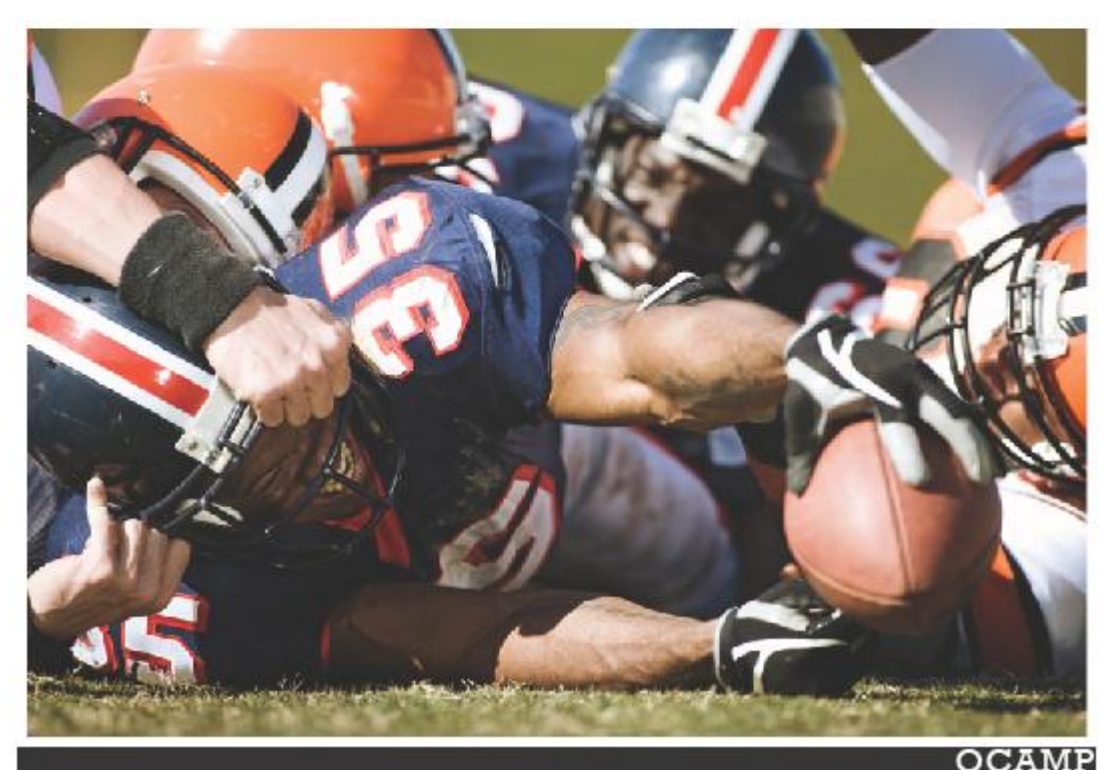
Oregon Concussion Awareness and Management Program

Lewis S. Mills High School, Connecticut Policy 'Smallville' Sample