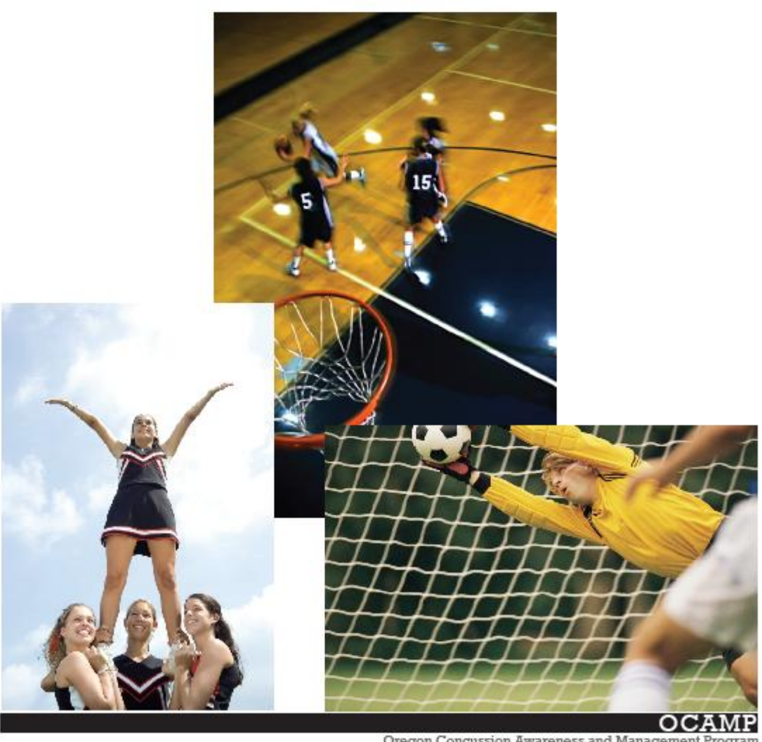
Oregon Concussion Awareness and Management Program

In recognition of the frequent and potentially serious complications of sportsrelated concussion, Oregon law requires schools to follow a specified Returnto-Play Protocol. Because the role of the coach in concussion management is critical, annual training about the symptoms and management of sports concussion is mandatory. This section includes information and resources for coaches about recognition and management of concussion.