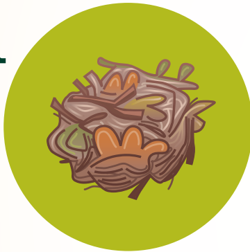
Tinder – small twigs, dry leaves or grass, dry needles.