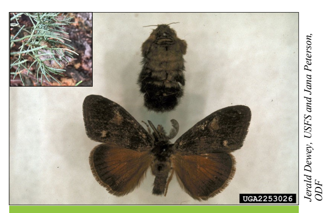
DFTM egg mass cocoon (inset); female (above) and male (below) adults

occurs from late July through August. Pupae are inside a thin, grey cocoon of silk webbing mixed with shed larval hairs.