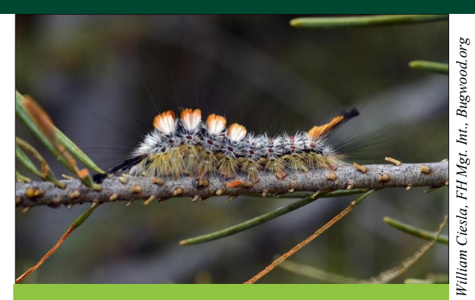
Douglas-fir tussock moth larva (coloration can vary)

The Douglas-fir tussock moth (DFTM; Orgyia pseudotsugata ) is a major defoliator of Douglas-fir and true firs in the western United States. Tussock moths occur in most forests in Oregon, but episodes of severe defoliation have been mostly restricted to the Blue Mountains of northeastern Oregon as well as Klamath and Lake counties. Trees growing along exposed ridges or on less productive sites are most at risk for attack. Defoliation by this insect can cause top kill, reduce radial growth and result in up to 40% tree mortality. Outbreaks typically subside within 1-2 years. Several agencies in Oregon annually survey for DFTM population spikes via pheromone-baited traps.