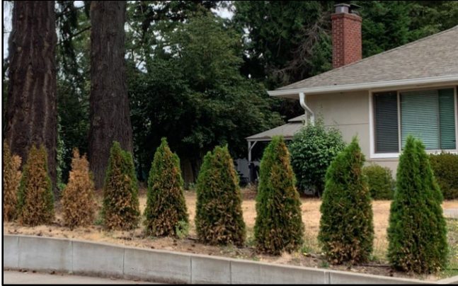
Arborvitae (western redcedar or eastern whitecedar cultivars) prefers cool, shaded environments and is not drought tolerant. It does not like crowding but it is often planted in rows in dry, sun-exposed lawns and slowly dies unless irrigated. Drought weakens tree defenses, allowing beetles to move into these trees and finish them off.

Climate change has resulted in long droughts and heatwaves across the state. So our landscape trees could use a little help from irrigation. You can aid them by planting the right tree in the right site and removing grass and other plants nearby that compete for moisture (leave some understory plants to prevent soil drying from sun and wind).