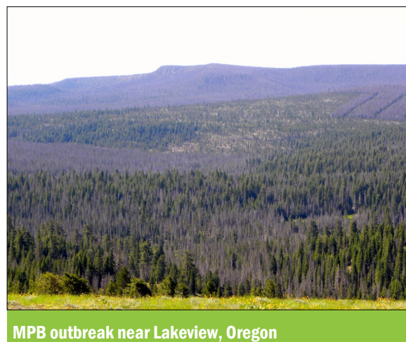
MPB outbreak near Lakeview, Oregon

of MPB attack. Trees need at least one year to benefit from increased resources and improved conditions created by thinning. Stands should be thinned ideally before outbreaks are allowed to reach adjacent areas.