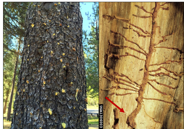
MPB pitch tubes (left) and gallery (right, arrow shows hook at bottom of gallery)

The presence of pitch tubes does not always indicate impending tree mortality, particularly if the MPB attacks