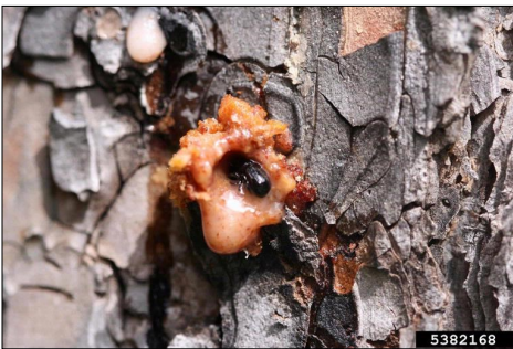
MPB adult caught in a sap flow (pitch tubes are signs of beetle attacks)