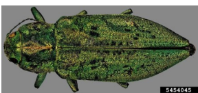
Steve Valley, ODA

Adults are 1.0-1.7cm long and bright metallic green. Larvae most frequently attack dead and dying redcedar and incense cedar but also cypress and juniper.