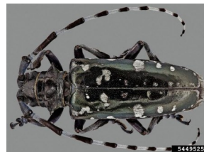
Steve Valley, ODA

Adults are 2.0-3.0cm long and shiny black with white spots. They may be confused with native banded alder borer which has bands not spots. Larvae attack many hardwood species.