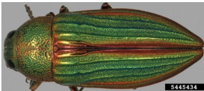
Steve Valley, ODA

Adults are approximately 2.0cm long and metallic yellow, green and red. Larvae attack dead or dying Douglas-fir or pine. Various other beetle species of similar shape and color also occur.