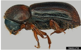
Steve Valley, ODA

Adults are often <0.5cm long and look similar to bark beetles. Ambrosia beetle larvae and adults attack dead and dying conifers or hardwoods. They create tiny holes in wood and vector fungal stains that can discolor wood - each of which may devalue some timber. See ODF Ambrosia fact sheet.