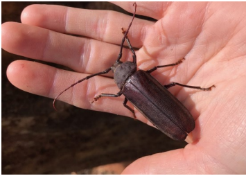
C. Buhl, ODF

Adults are 4.5-7.0cm long, brown with non-serrated antennae. Larvae attack dead and dying Douglas-fir or pine. The mandibles and boring action of these larvae inspired the 'teeth' on the modern chainsaw chain.