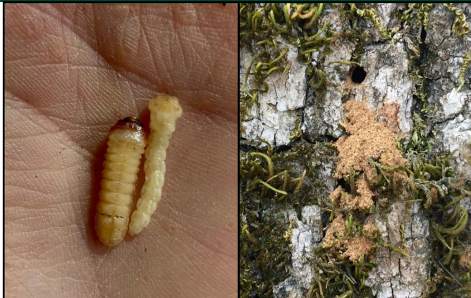
C. Buhl, ODF