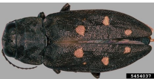
Steve Valley, ODA

Adults are 0.7-1.0cm long and have six light-colored spots. Larvae attack stressed or dying Douglas-fir, often attacking trees that are growing outside of their preferred range or exposed to drought conditions. This species