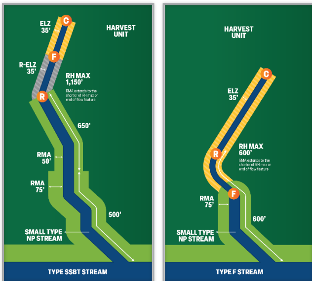
These diagrams are examples only and are not to scale. Conditions and requirements may differ.