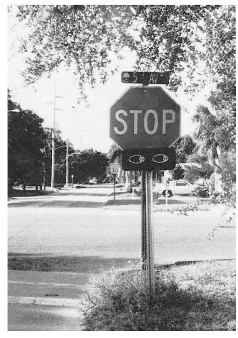
Van Houten, Retting 2001

Studies have compared the effectiveness of multiple devices to enhance stop-controlled intersection safety. In addition to testing flashing LED stop signs, Gates, Carlson and Hawkins (2004) considered orange overhead flags as a low-cost method of increasing warning sign conspicuity, although these were only effective during daylight hours and tended to fade quickly. They also found that flashing beacons worked well in both day and