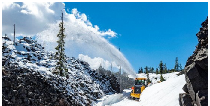
Prioritize plowing and deicing on interstates and key freight routes.

We strongly recommend travelers carry a fully stocked emergency kit, including a phone charger and weather-appropriate clothing, and refuel or recharge their tanks often.