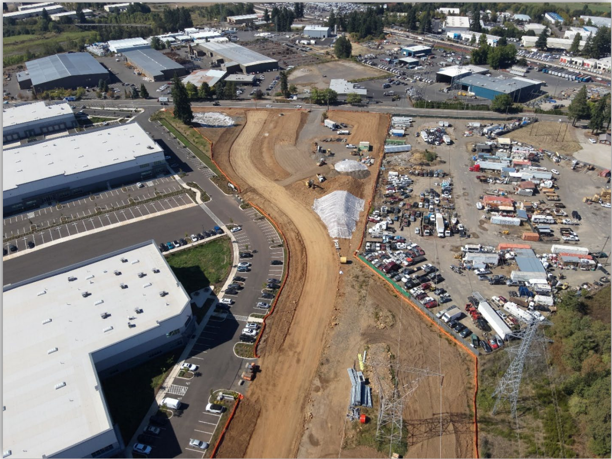
Sherwood's Ice Age Drive

To Federal Highway Administration and Federal Transit Administration