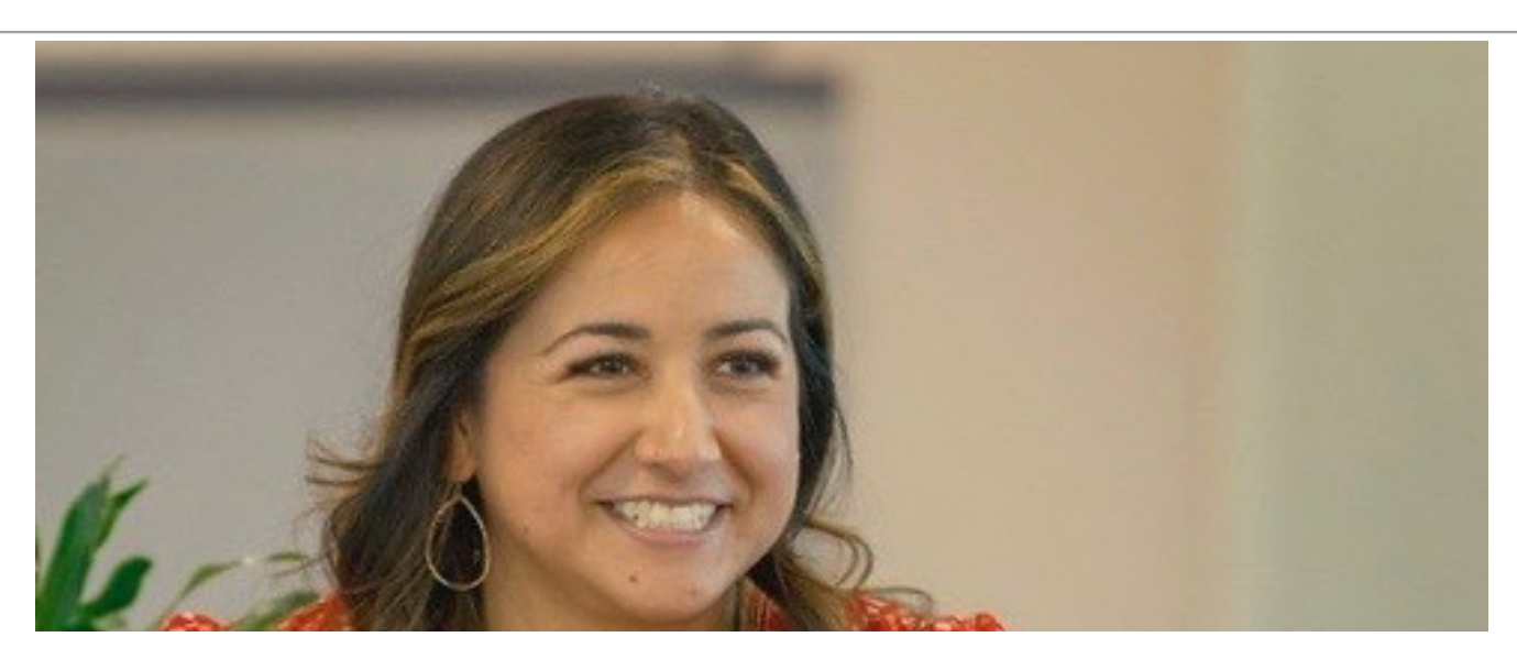
DBE Advisory Committee

Review Proposed DBE Goal for 2023 - 2025.