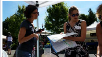
An outreach event during the popular downtown Farmer's Market.