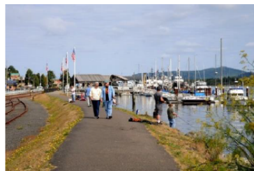
Coos Bay Boardwalk Trail

The community is engaged in the process to ensure that transportation issues, problems, and needs are identified and solutions reflect community preferences.