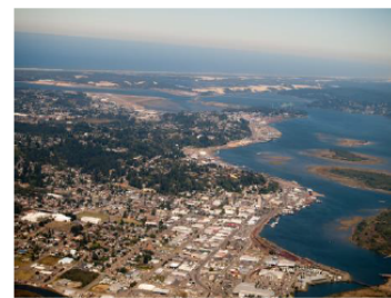
Aerial view of Coos Bay and North Bend

Forecast Future Transportation Deficiencies and Needs for vehicles, bicycles and pedestrians.