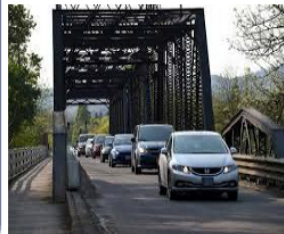
Eastbound traffic on the Van Buren Street Bridge