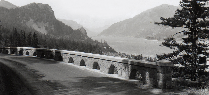
G-7 Columbia River Gorge, near Mitchell Point - Columbia River Highway, Oregon