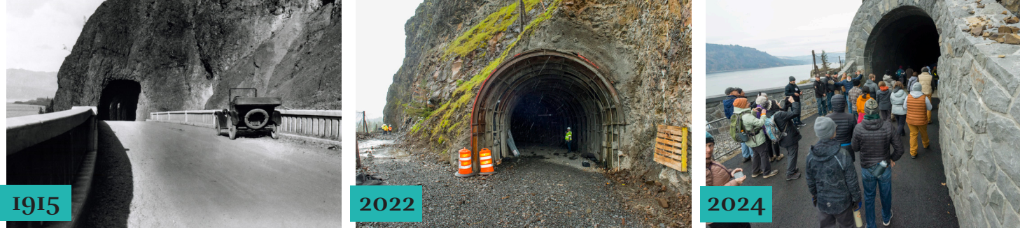
Mitchell Point Tunnel's west tunnel entrance through the years

Constructed between 1913 and 1922, the Historic Columbia River Highway overcame all odds to lay lightly on the land and take its users to beautiful spots and breathtaking vistas of the Columbia River Gorge. During the construction of I-84, 22 miles of the highway were left abandoned or destroyed. We are reconnecting the Historic Highway between Troutdale and The Dalles by transforming abandoned sections into the State Trail.