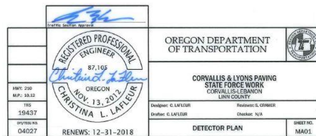
Figure 22-1 | State Force Work Title Block

The title block should state “STATE FORCE WORK” in the project information area to clearly identify that the modifications are not contract work. See Figure 22-1.