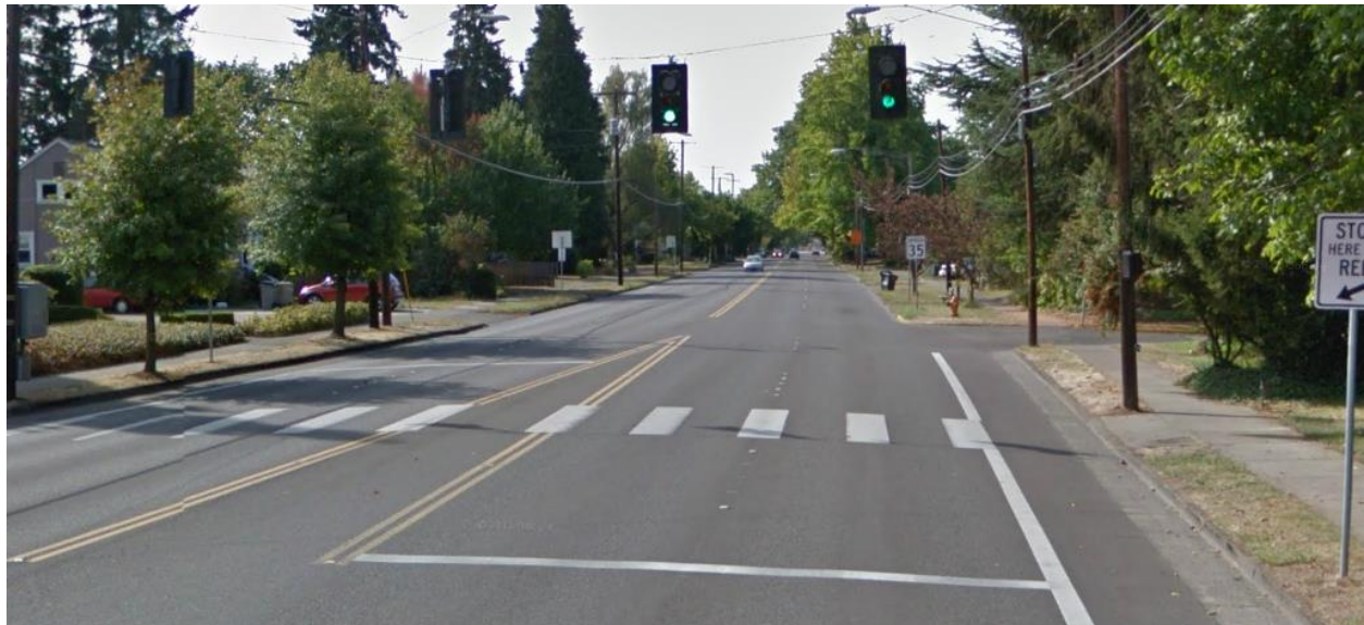
Figure 14-1 | Pedestrian Signal Installed Mid-Block, Example 1

Note that many of the, old archived “pedestrian signal” plan sheets are actually overhead continuous operation warning beacons with pedestrian crossing signs, not true pedestrian signals.