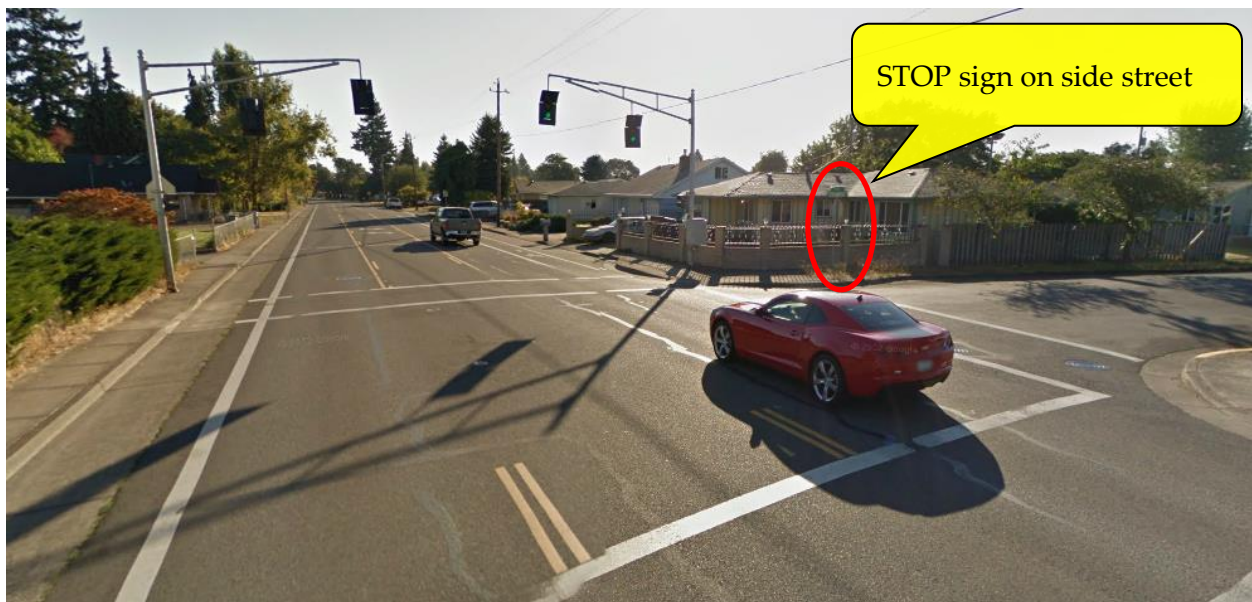
Figure 14-5 | Pedestrian Signal Installed at Intersection (Half-Signal), Prohibited

Half-signals are PROHIBITED on the State Highway.